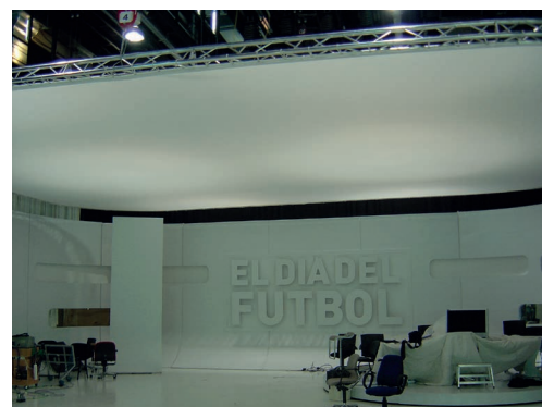
Butterfly manufactured with Grid Cloth

All materials are supplied edge-finished with ties and grommets. Filter grip panels are sewn on to a fabric edge tape, which gives strength and flexibility, up to any size and in different colours to facilitate identification of some of the materials used in butterfly production: Green for all Single Net (black and white), Red for all Double Net (black and white) and Yellow for Silk (natural and artificial). The rest of the filter grip panels have the most appropriate colours to go unnoticed. All butterfly panels are delivered in water resistant bags.